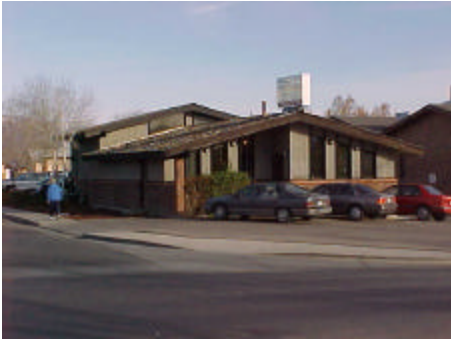
WSSG Building 2356 Nth 7th Street